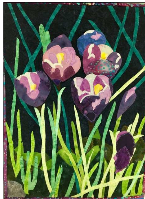
Fabric Art by Ava Neff

“Art in the Garden” Juried Show at Green Spring Gardens, December 17-February 25 Right: First Place Grace Rooney, Field of Fleurs, Watercolor