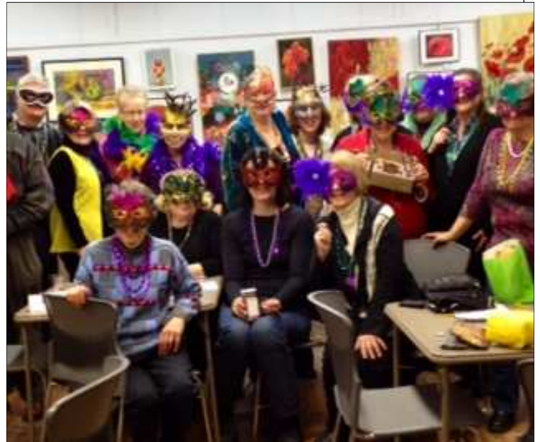
Members and guests at the February Mardi Gras BUNCO Fundraiser - who says art isn't fun?