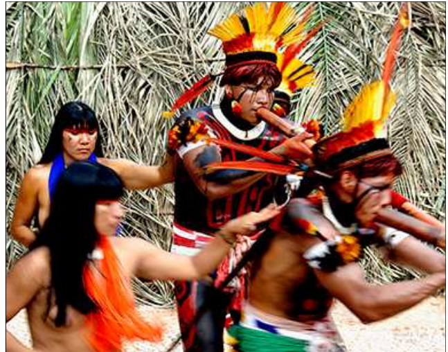
“Xingu Indians Dancing for Amazon Eco-Services”