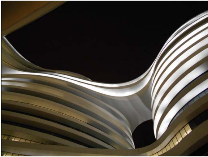
Galaxy Soho, Beijing