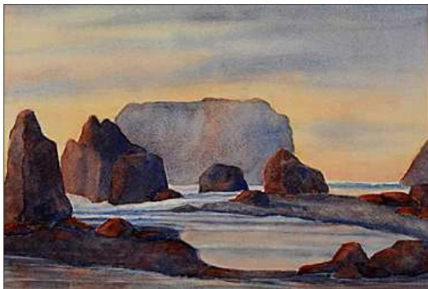
Evening at the pool