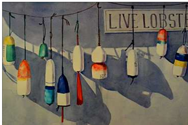
Hung out to Dry