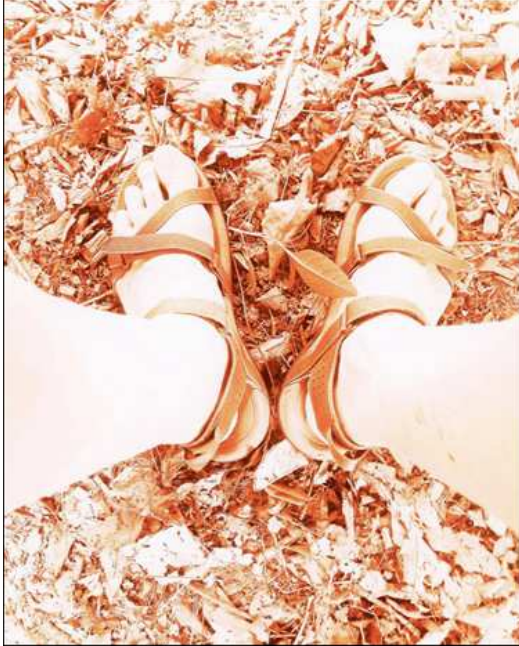
“Hiding Tree”