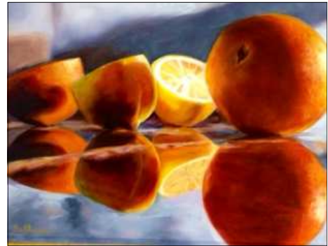
"Orange Afternoon" Oil by Anne Calhoun