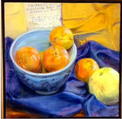
"Four Oranges" Oil Painting by Vivian Attermeyer