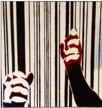
First Place/Maico Vergara/oil