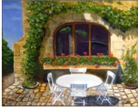
Davi D' Agostino/ Cafe at Chateau Milandes/Oil