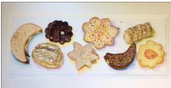
"Cookies as Landscape" Watercolor by Joan Dimond