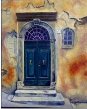
Davi D'Agostino/Blue Door. Oil