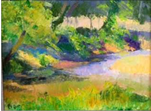
by Beverly Rice/ Creek Near Sperryville / Oil