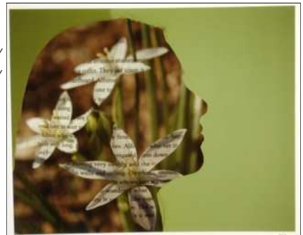
Honorable Mention/ Jennifer Cyphers/Watercolor/