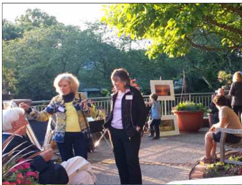
Enjoying the Reception